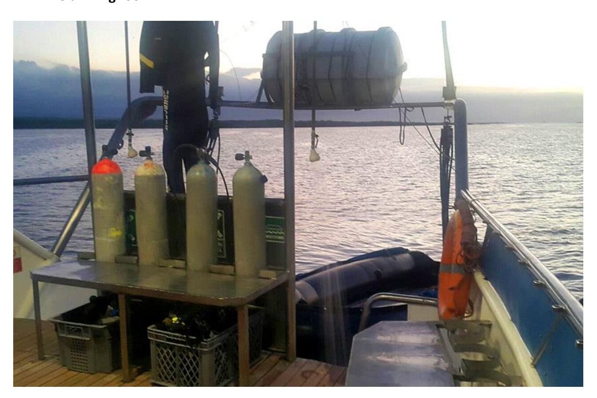
The filling station