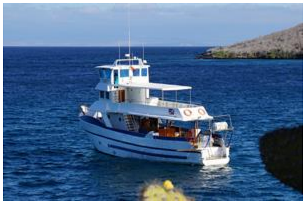
The cruise ship