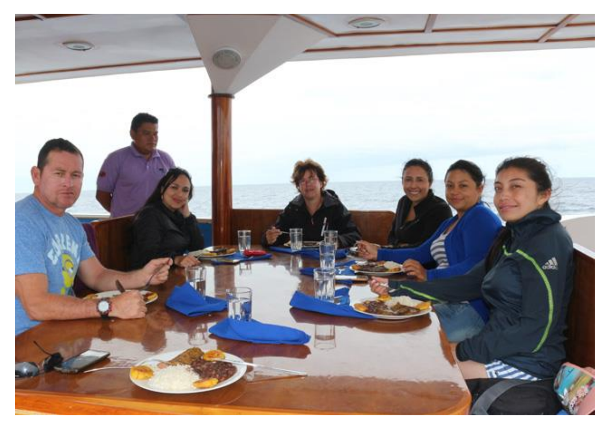
The dinning room