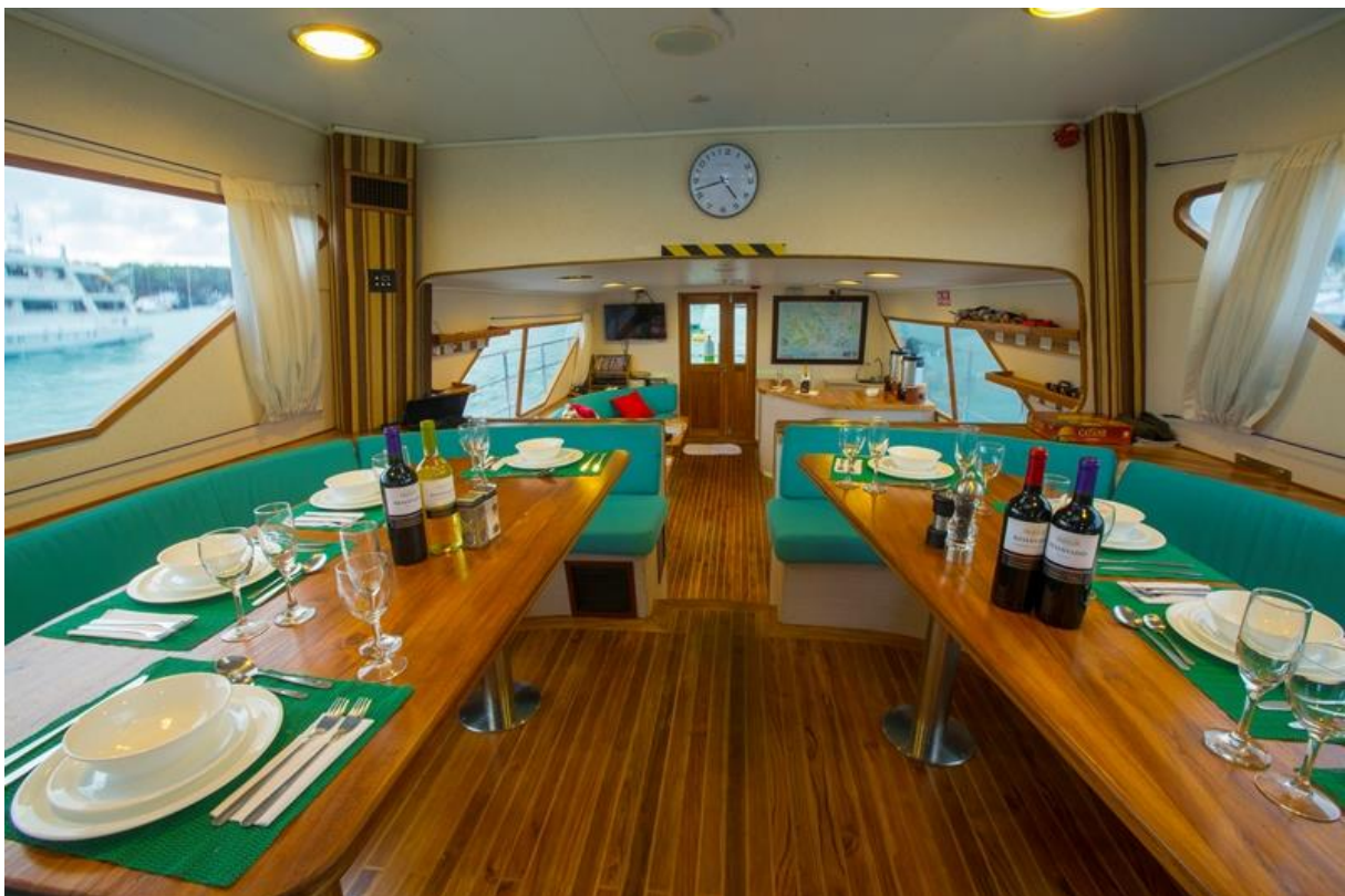
The dining room