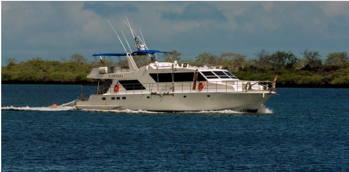
The cruise ship