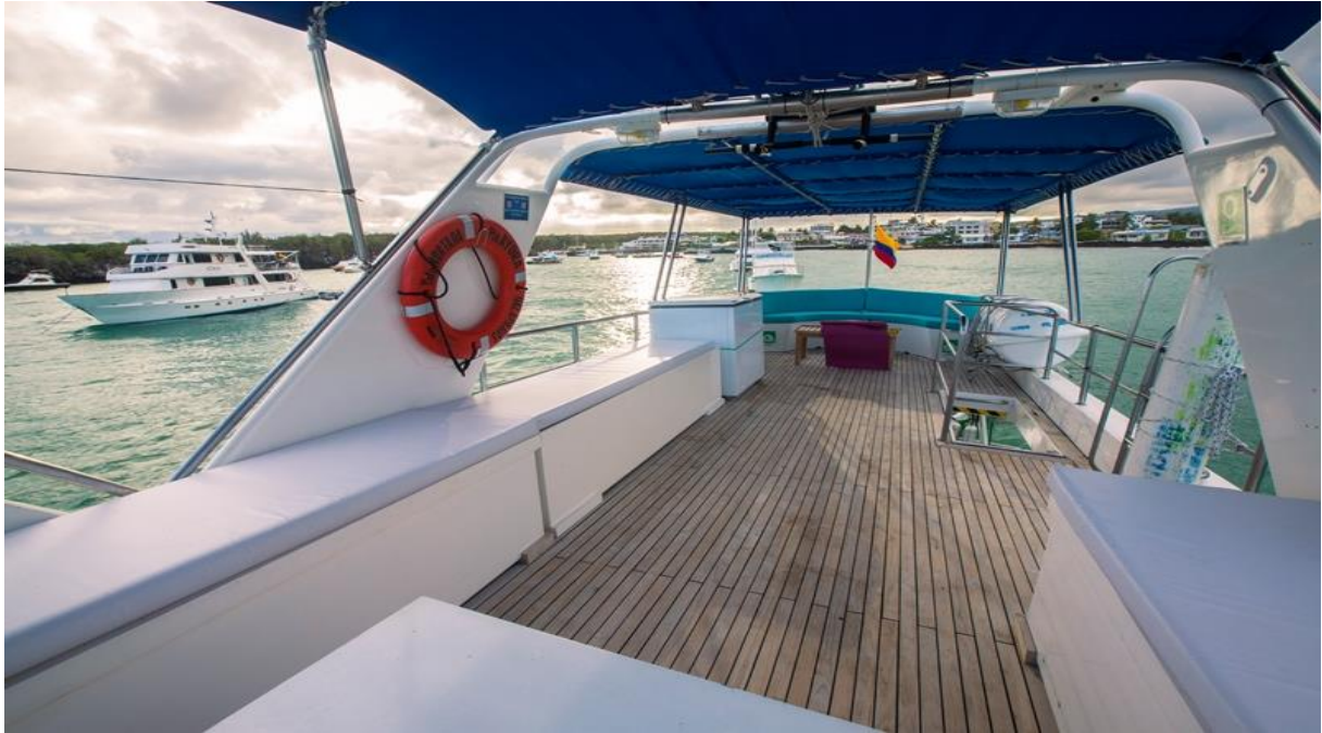
The social area