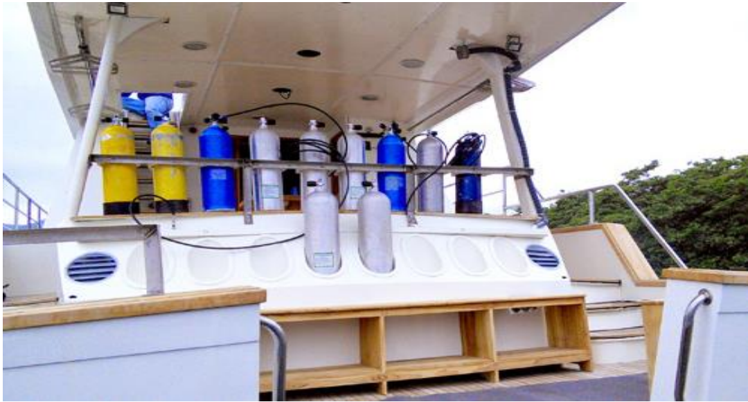
The filling station